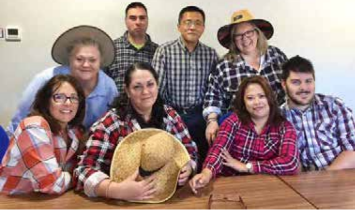
RICHMOND Students CHC33015 CERT III Individual Support (LEFT)