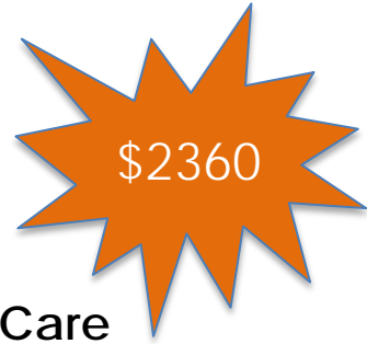
LAKEMBA Students CHC30113 CERT III Early Childhood and Care (BELOW)