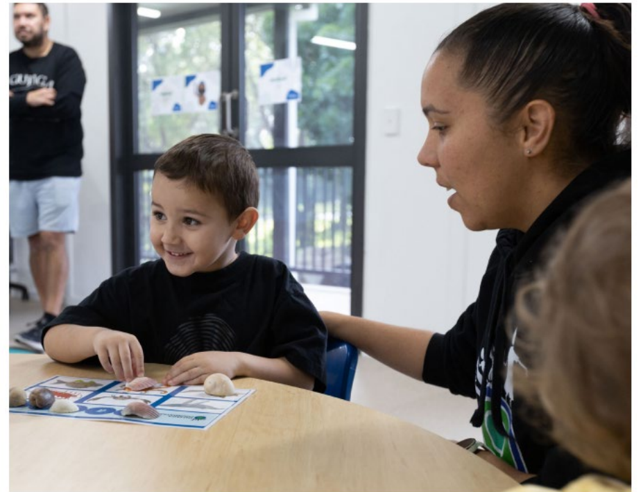
Children learning at Gujaga child care centre.