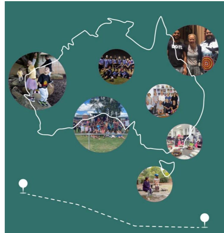
Where are we: Placed-based approaches to tackling community challenges in Australia